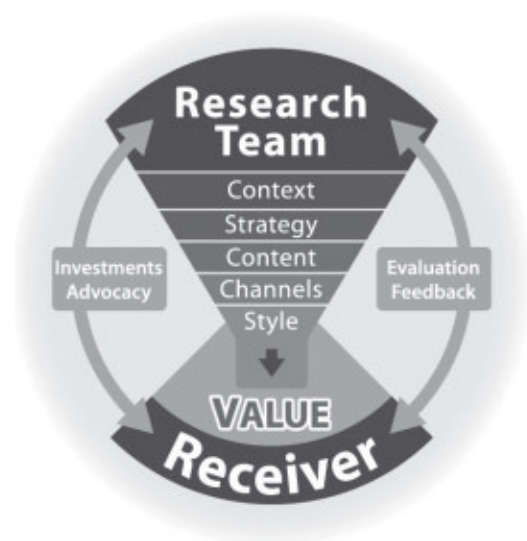
FIGURE 1 Elements of the communication process.

by state and federal transportation officials, research managers, and others in the transportation research community (see sidebar, below).