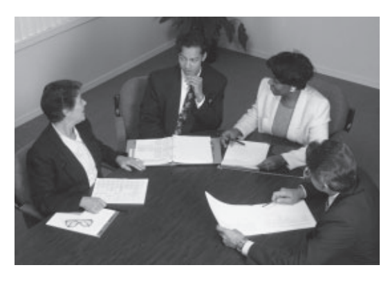
Effective research programs often recruit communications professionals to assist in conveying the value of research.