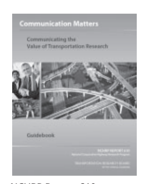
NCHRP Report 610, Communicating the Value of Transportation Research—Guidebook, is available from the TRB online bookstore. www.trb.org/bookstore: to view the book online. go to http://onlinepubs. trb.org/onlinepubs/nchrp/ nchrp_rpt_610.pdf. The contractor's final report on the research associated with NCHRP Project 20-78, which produced the guidebook, was published as Web-Only Document 131, http://onlinepubs.trb. org/onlinepubs/nchrp/ nchrp_w131.pdf.