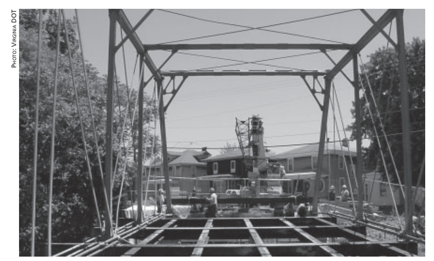
One of the projects highlighted in NCHRP Report 610 is the preservation of the historic Hawthorne Street Bridge in Covington, Virginia, by Virginia DOT and the Virginia Transportation Research Council.